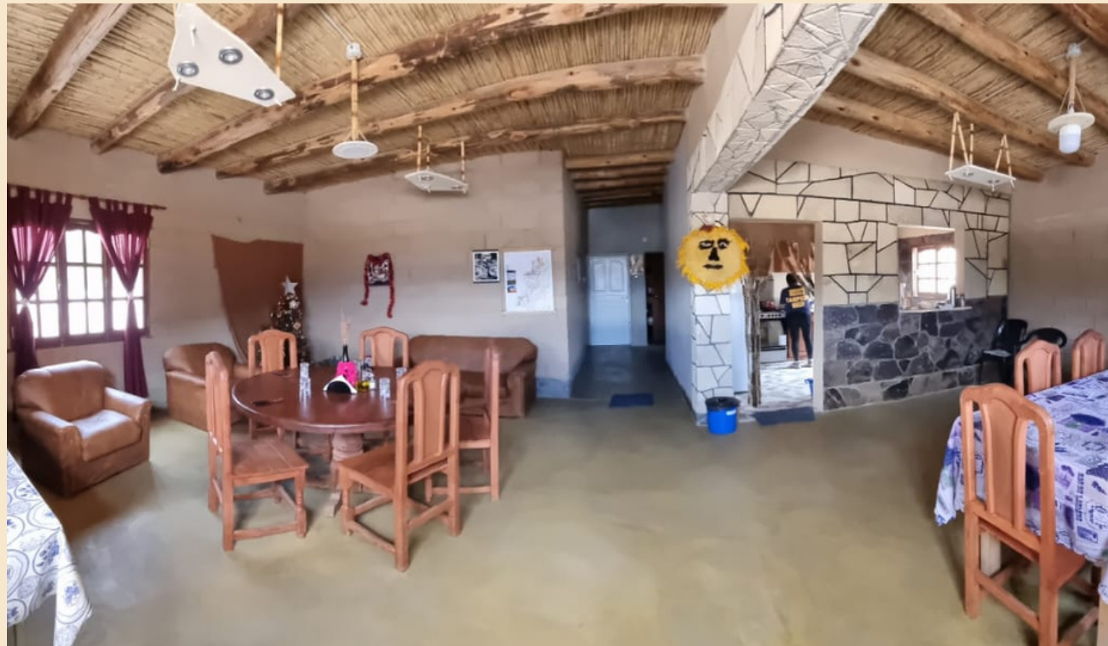
Casa de Altura Antofalla

Simple house with 3 bedrooms with private bathrooms, 2 simple external bedroom with one bathroom. A common dining area to enjoy homecooked Andean meals.